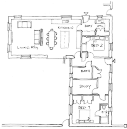
FLOOR PLAN ~ PLOT 1 1:100