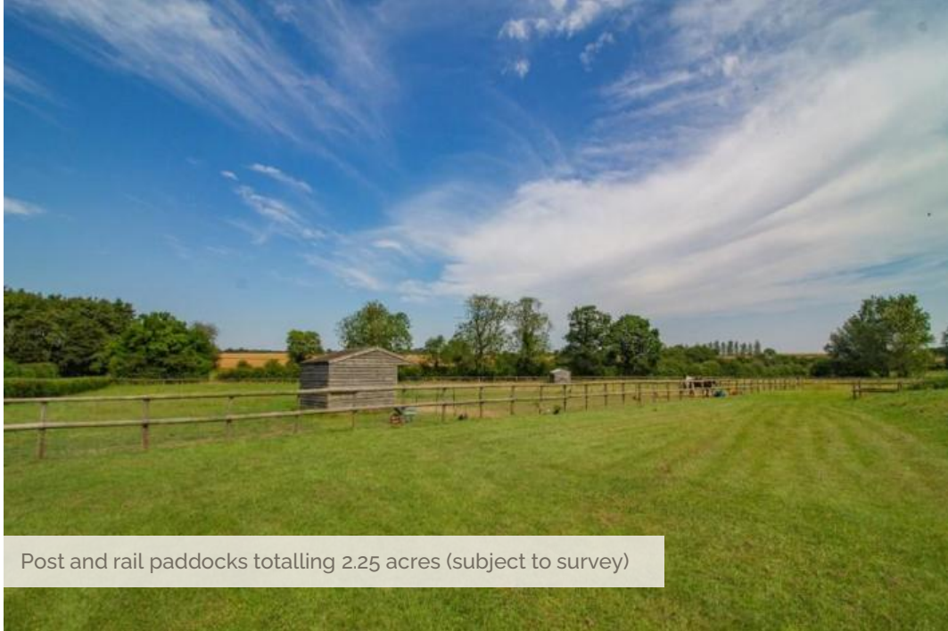
Post and rail paddocks totalling 2.25 acres (subject to survey)