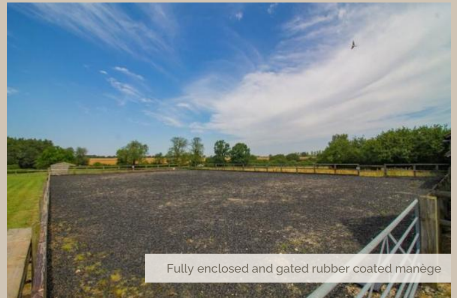
Fully enclosed and gated rubber coated manège