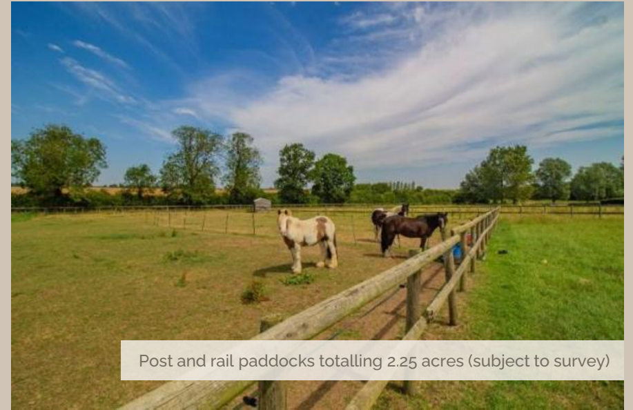
Post and rail paddocks totalling 2.25 acres (subject to survey)

There is a wide choice of excellent schooling, both Private and State, within the area. Private includes: Culford School (1-19); South Lee School (2-13). State includes: Cockfield CEVC Primary School (4-11); Thurston Community College (11-18). University of Suffolk at West Suffolk College - Further Education.