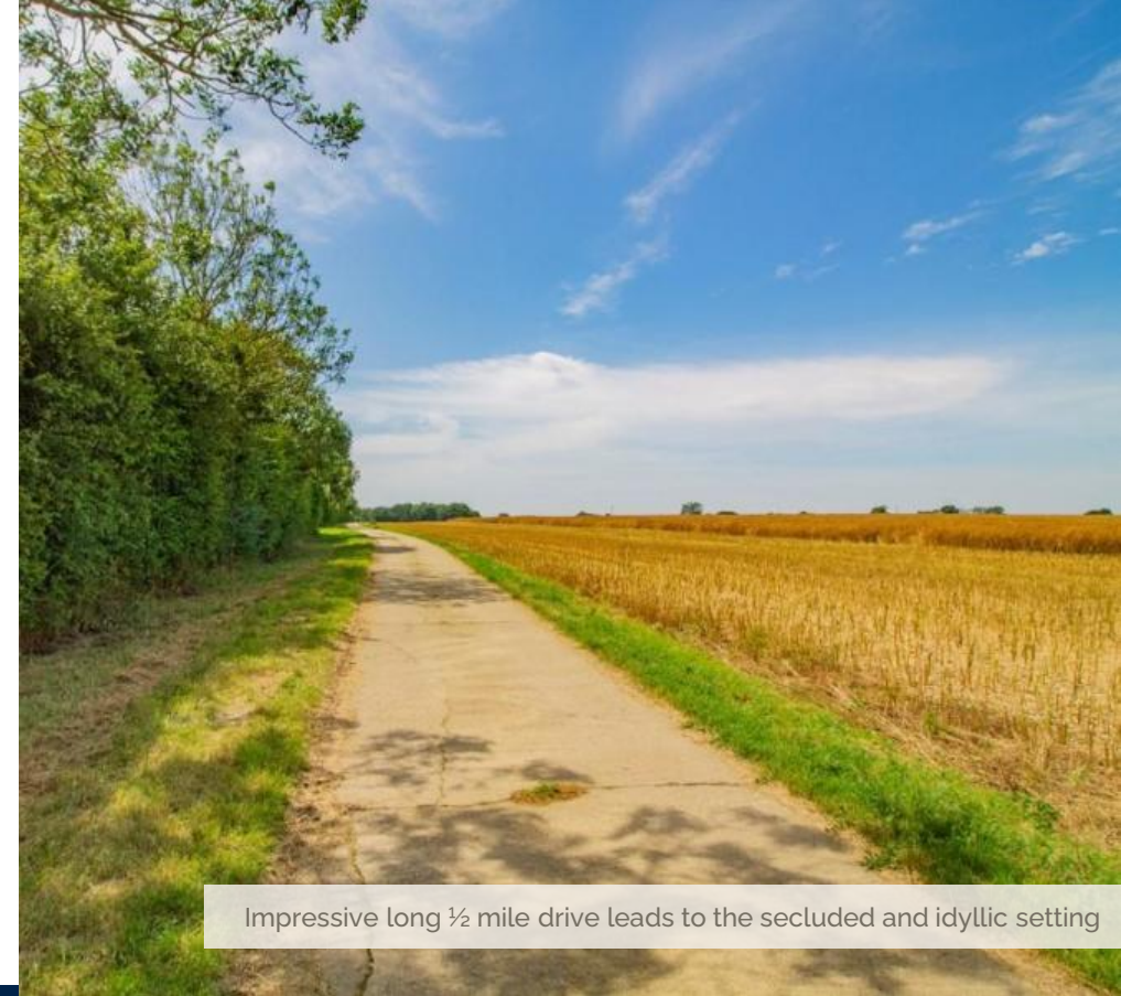
Impressive long ½ mile drive leads to the secluded and idyllic setting

Strictly by prior appointment through the landlord's sole managing agent: Whatley Lane. If there is anything of particular importance, please contact us to discuss in advance of the viewing.