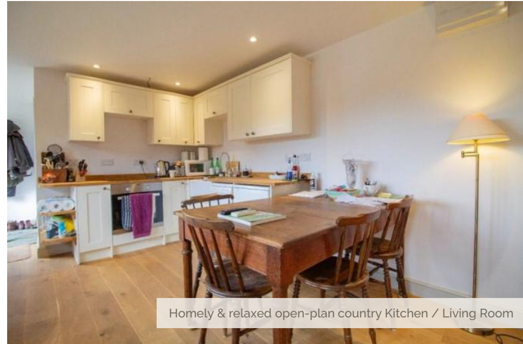
Homely & relaxed open-plan country Kitchen / Living Room

Suite comprising corner shower unit, pedestal wash basin and low-level wc. Heated towel rail. Mirrored vanity cabinet. Recessed lighting.