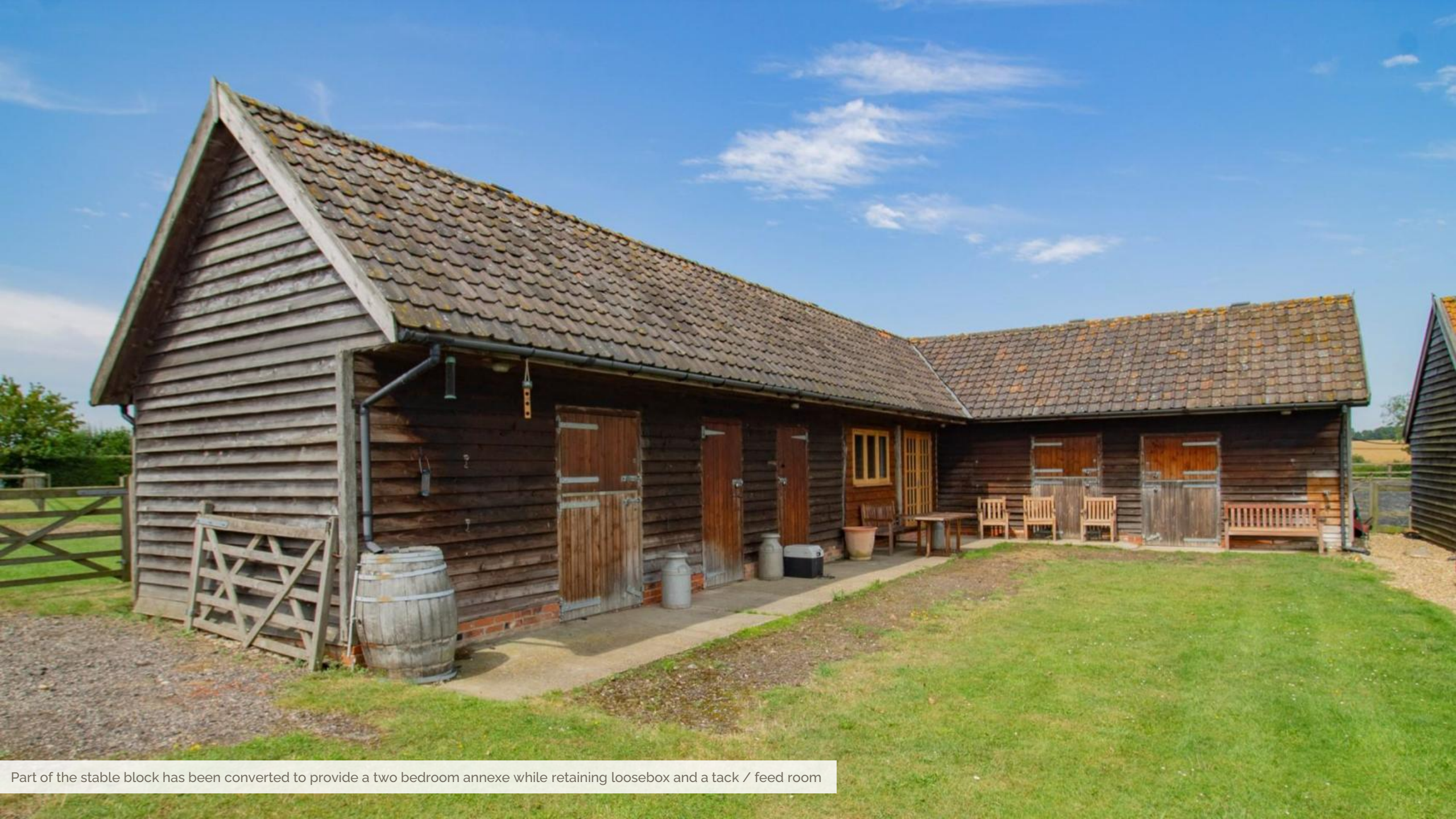
Part of the stable block has been converted to provide a two bedroom annexe while retaining loosebox and a tack / feed room