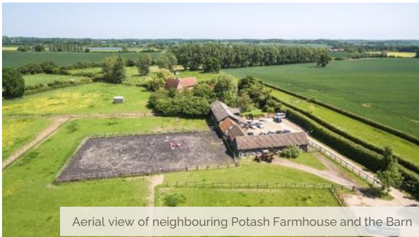
Aerial view of neighbouring Potash Farmhouse and the Barn