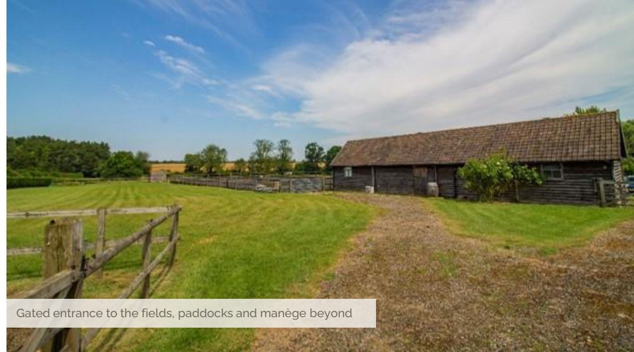
Gated entrance to the fields, paddocks and manège beyond