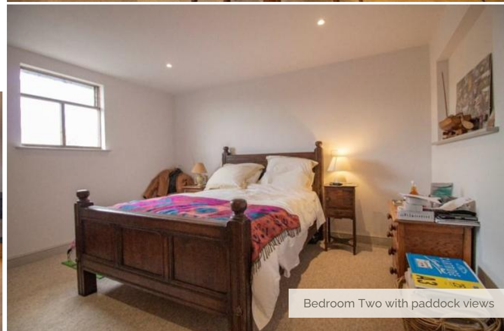
Bedroom Two with paddock views