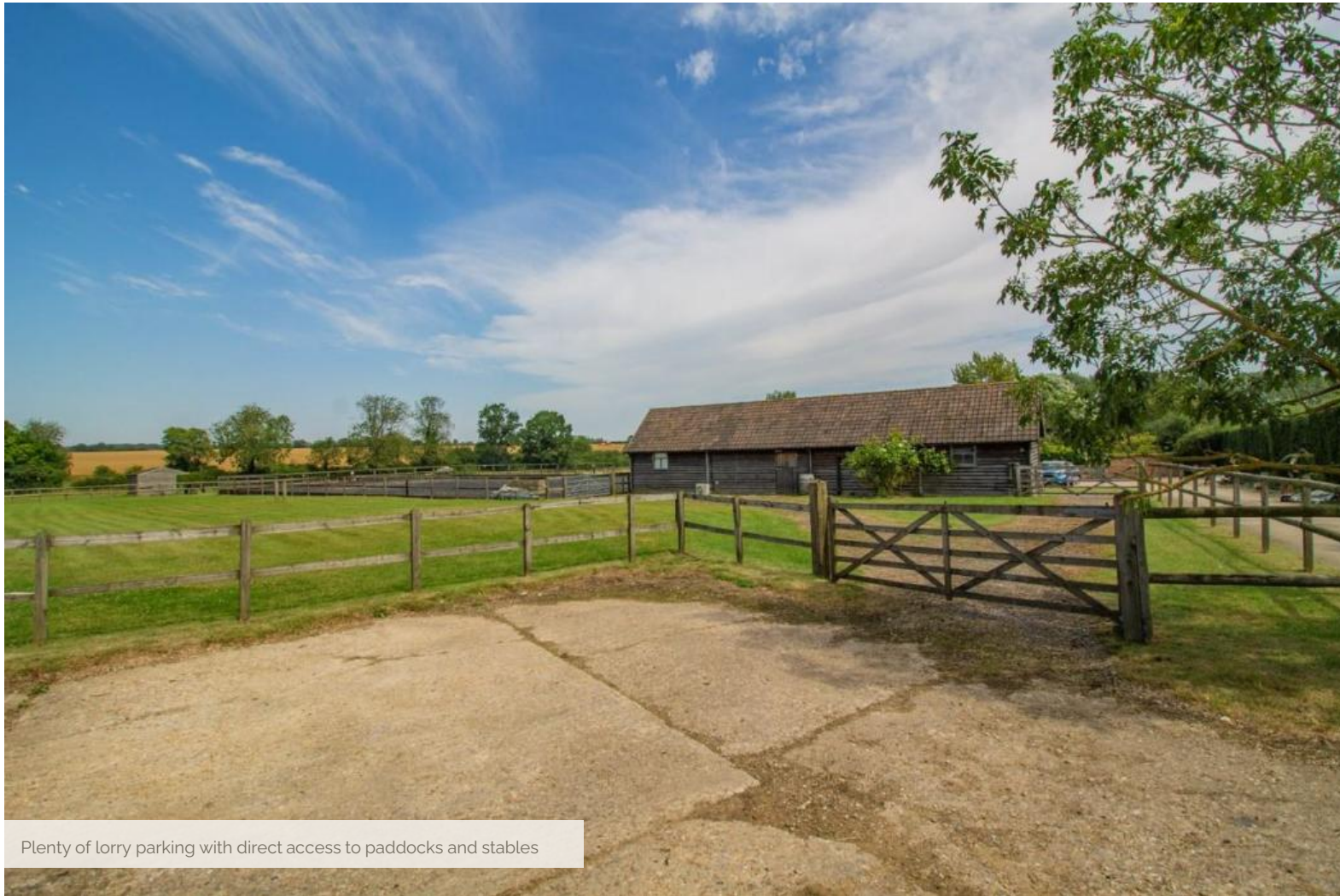
Plenty of lorry parking with direct access to paddocks and stables